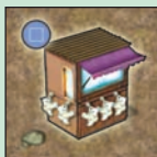
1 Souvenir shop